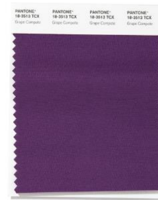
PANTONE 18-3513 Grape Compote

Earthy and warm, Cinnamon Stick is sweet yet spicy.