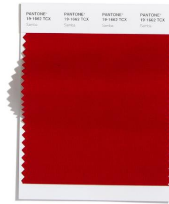
PANTONE 19-1662 Samba

A radiant autumnal orange, Amberglow promotes self-confidence and creative self-expression.