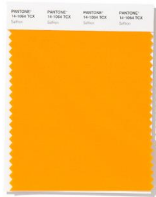
PANTONE 14-1064 Saffron

Burning bright, Flame Scarlet exudes confidence and determination.