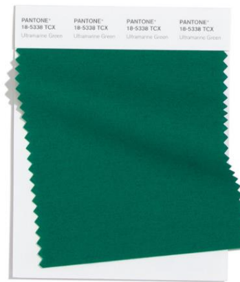
PANTONE 18-5338 Ultramarine Green

A gentle dusky pink, Rose Tan imparts a sense of composure.