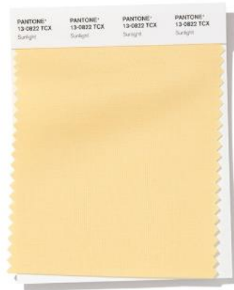
PANTONE 13-0822 Sunlight

Soft Sunlight invites happiness, pleasant cheer and a smiling presence.