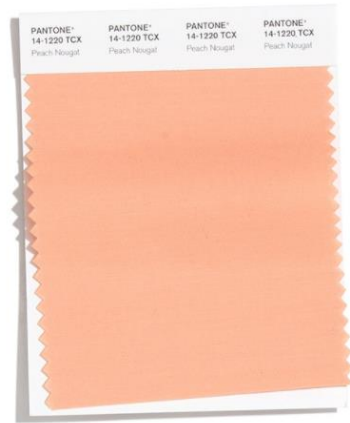
PANTONE 14-1220 Peach Nougat

Nurturing Peach Nougat embraces with its inviting warmth.