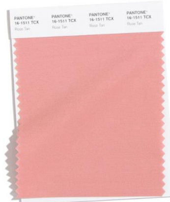
PANTONE 16-1511 Rose Tan

Optimistically rebellious, Green Sheen is a bold acidic yellow-green shade that will always stand out.