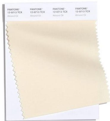
PANTONE 12-0713 Almond Oil

Tasteful Almond Oil is a smooth and subtle off-white shade.