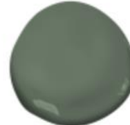
Cushing Green HC-125