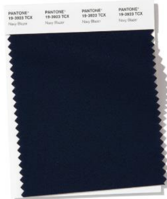
PANTONE 19-3923 Navy Blazer

Authentic and low-key, Lark is an understated and versatile khaki.