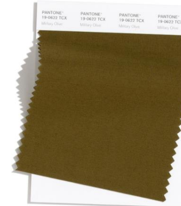
PANTONE 19-0622 Military Olive

Highlighting our desire for longevity, Sleet is a timeless gray that is dependable, solid and everlasting.