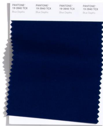
PANTONE 19-3940 Blue Depths

Tasteful Almond Oil is a smooth and subtle off-white shade.