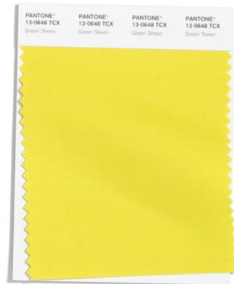
PANTONE 13-0648 Green Sheen

Optimistically rebellious, Green Sheen is a bold acidic yellow-green shade that will always stand out.