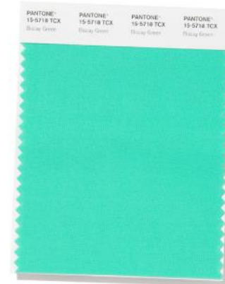
PANTONE 15-5718 Biscay Green

A boundless blue hue, Classic Blue is evocative of the vast and infinite evening sky opening us up to a world of possibilities.