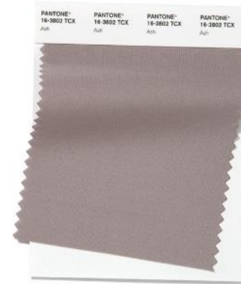
PANTONE 16-3802 Ash

Clean, crisp and pristine Brilliant White is suggestive of simplicity and modernity.