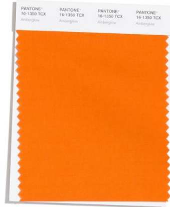
PANTONE 16-1350 Amberglow

A radiant autumnal orange, Amberglow promotes self-confidence and creative self-expression.