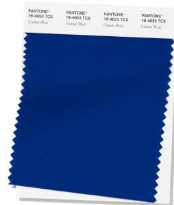
PANTONE 19-4052 Classic Blue

Pungent Saffron adds a flavorful brilliance to the palette.