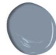
Oxford Gray 2128-40