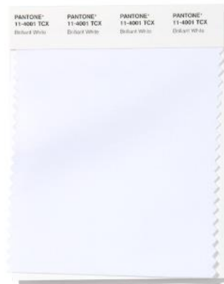
PANTONE 11-4001 Brilliant White

Deep blue Navy Blazer is stylish and self-assured.