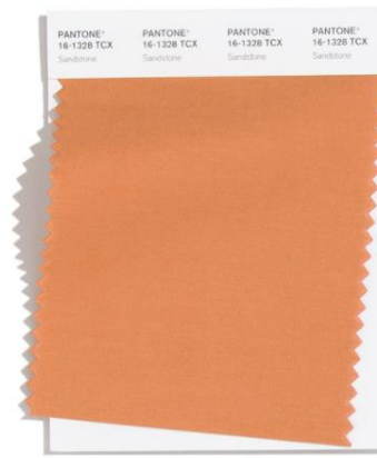
PANTONE 16-1328 Sandstone

A voluptuous sultry red, Samba introduces an upbeat energy.