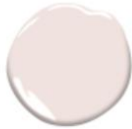
First Light 2102-70