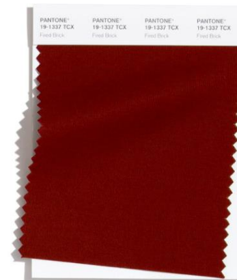
PANTONE 19-1337 Fired Brick

Ultramarine Green, a deep cooling blue-green, exudes self-assurance and poise.