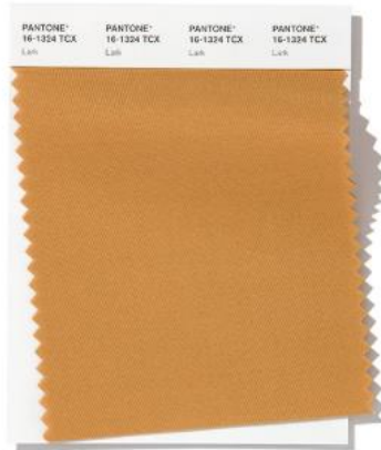
PANTONE 16-1324 Lark

Authentic and low-key, Lark is an understated and versatile khaki.