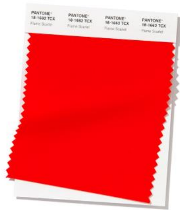
PANTONE 18-1662 Flame Scarlet

Burning bright, Flame Scarlet exudes confidence and determination.