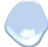
Windmill Wings 2067-60