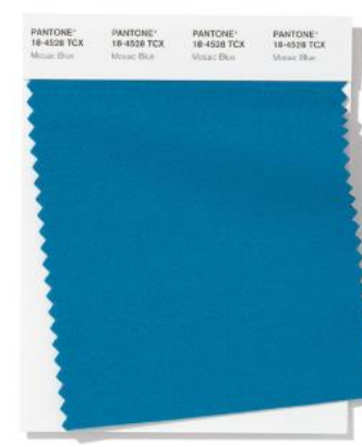
PANTONE 18-4528 Mosaic Blue

Piquant Orange Peel introduces a tasteful tang.