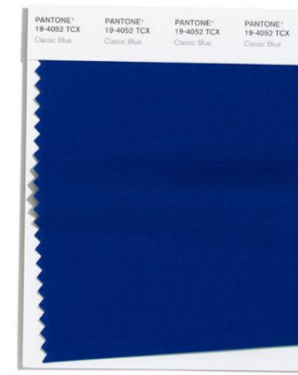
PANTONE 19-4052 Classic Blue

Tied to nature, earthy Sandstone speaks of the rustic outdoors.