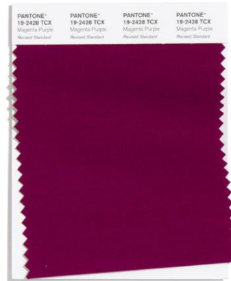
PANTONE 19-2428 Magenta Purple

Nurturing Peach Nougat embraces with its inviting warmth.