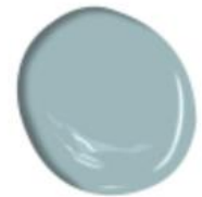
Buxton Blue HC-149