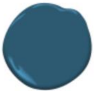
Blue Danube 2062-30