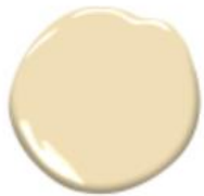
Golden Straw 2152-50