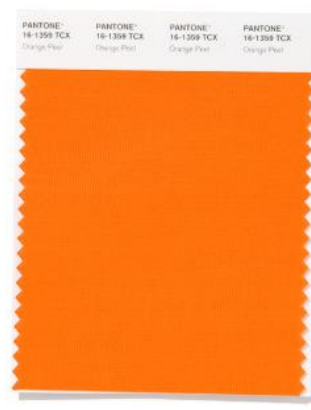
PANTONE 16-1359 Orange Peel

Faded Denim, a relatable and dependable blue conveys comfort and ease.