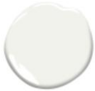
White Heron OC-57