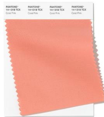
PANTONE 14-1318 Coral Pink

Soft Sunlight invites happiness, pleasant cheer and a smiling presence.