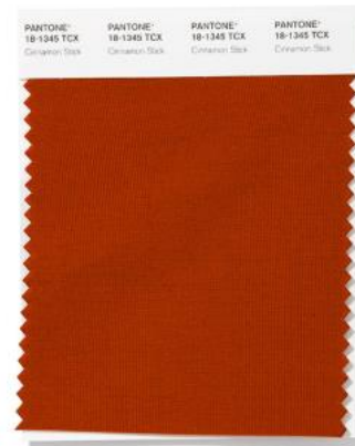
PANTONE 18-1345 Cinnamon Stick

Coral Pink wraps you up in a warm and welcoming embrace.