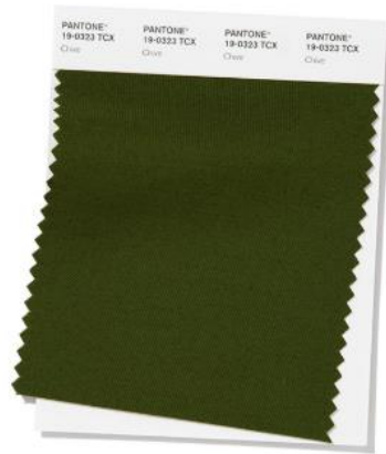
PANTONE 19-0323 Chive

A savory herbal green, Chive imparts a healthy and restorative harmony.