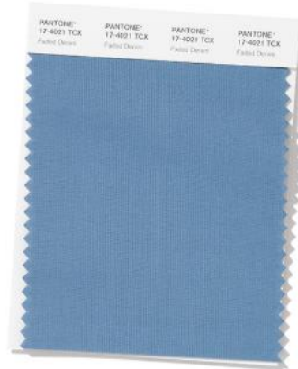
PANTONE 17-4021 Faded Denim

A savory herbal green, Chive imparts a healthy and restorative harmony.