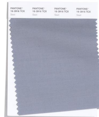
PANTONE 16-3916 Sleet

Blue Depths implies an air of mystery and the unknown.